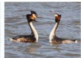
Great Crested Grebes

This is the key species of the open water and was first recorded in 1955. They appeared soon after the reservoir was full. The first record of breeding was in 1959. Since 1963 they have bred nearly every year. The annual maximum count for the whole reservoir increased steadily and reached 100 in 1981. It has fluctuated around that ever since. Unless the reservoir is at a very low level more than 50 are frequently seen from the hide and viewing area which is the best place to watch them. During the nesting season there is often a nest visible from here too.