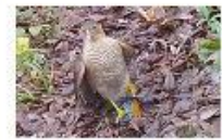
Trail camera photo of a Sparrowhawk taking a Kingfisher.